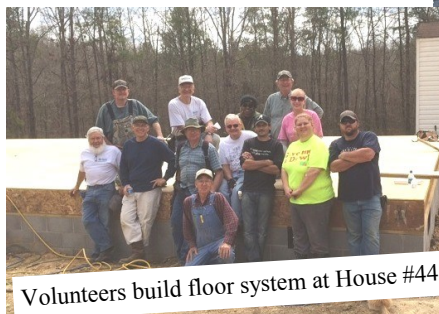
Volunteers build floor system at House #44