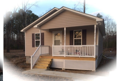
House #43—Rainbow City, AL