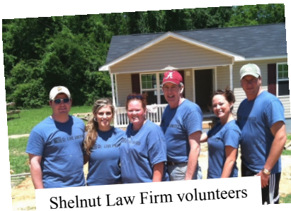
Shelnut Law Firm volunteers

Volunteer....Donate....Help a Family....Change a life.....Build a dream....Make a difference....Habitat for Humanity