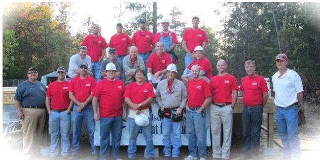
Volunteers from Alabama Power Co. & B.D. Welch Construction Co.