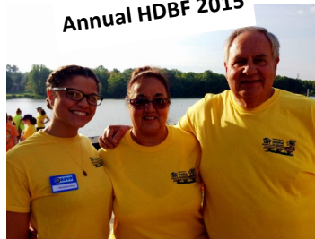
Volunteers at 4th Annual HDBF 2015