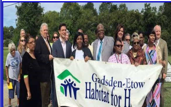
Groundbreaking Ceremony House #48